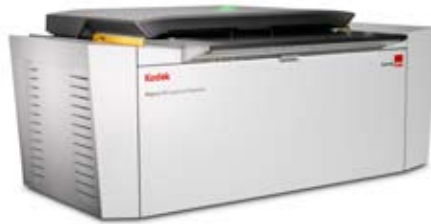
Kodak Magnus 800 Platesetter

Staccato Screening produces high-fidelity images that exhibit fine detail, creating a photographic experience in print that is free of visible printing artifacts. It provides you with a clear competitive edge and differentiator that print buyers can easily understand by simply putting a loupe to your presswork.