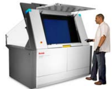
Kodak Trendsetter 800 Platesetter with Autoloader

With the autoloader option, the Trendsetter 800 Platesetter can produce up to 42 plates per hour. A new, more powerful thermal imaging head increases productivity with Kodak Thermal Direct Non Process Plates . In addition, choosing the Trendsetter 800 Quantum Platesetter enables you to achieve even finer levels of screening for outstanding print quality.