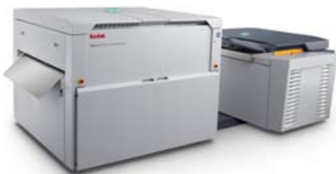
Kodak Magnus 800 Quantum Platesetter, with Automatic Pallet Loader

The Kodak Magnus 800 Platesetter provides the highest levels of throughput and automation, along with Kodak SQUAREspot Imaging Technology for maximum stability, accuracy, and repeatability in imaging. With the Kodak Magnus 800Z Quantum Platesetter, you can achieve photorealistic print results with 20-micron or optional 10-micron Kodak Staccato Screening. The Magnus 800Z Platesetter images up to 60 plates per hour, and a new advanced thermal head generates double the laser power and provides broader imaging latitude and greater stability.